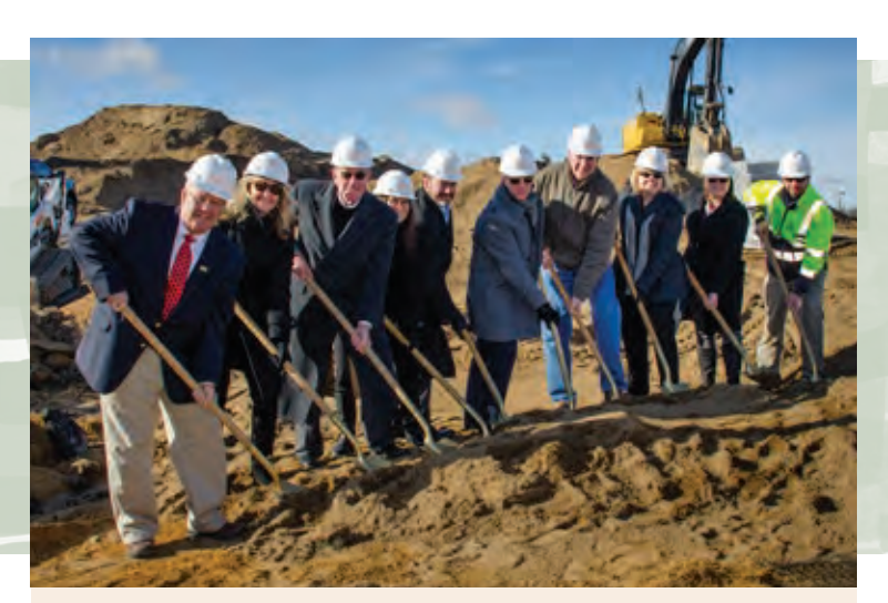
A recent groundbreaking ceremony in New Prague marked the start of a new community being built by Makado to serve people in rural areas. Augustana Care will provide care and services.

This past winter, a groundbreaking marked the beginning of an engaging new life-enrichment community in New Prague, called Praha Village. Independent living, assisted living and memory care will be offered by owner Makado. Augustana Care will provide care and services.